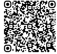
QR Code -Express